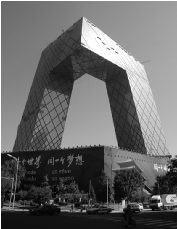
The headquarters of CCTV in Beijing: For several years the largest Chinese TV station has had a new head office and now broadcasts in the six official languages of the United Nations.

Along with the quantitative growth of international reporting, the format of programming has also changed. CCTV has been able to hire local and foreign journalists and presenters from well-known news agencies and television stations; the number of foreign correspondents has multiplied, and particularly young foreign trained junior journalists are promoted. Unlike in domestic broadcasting, critical interviews, debates between experts and the involvement of public opinion help to strike a new tone at CCTV News , the English-language news channel. The channel airs under the banner of “objective reporting”. It seems that foreign programming is subject to a lesser degree of political control than those in China itself. The uprisings in Tahrir Square in Cairo, the student protests in Turkey, secession demands in eastern Ukraine: issues of territorial integrity and the questioning of the social and political order are no longer taboo subjects – as long as they do not concern China directly. So far, China’s international radio and television broadcasting are focusing on economically important markets.