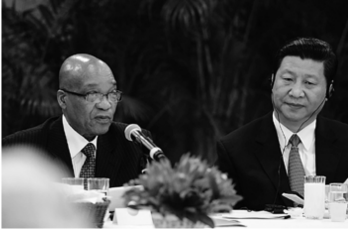
South African President Jacob Zuma with Chinese Head of State Xi Jinping 2013 in Durban: Chinese cultural diplomacy, especially in Sub-Saharan Africa, goes hand in hand with development aid, which is allegedly without preconditions.

a country's reputation for credibility". 44 China's de facto social pluralism must therefore also be present in its cultural diplomacy. Only then can China counter any suspicion of attempting to generate soft power exclusively through State power.