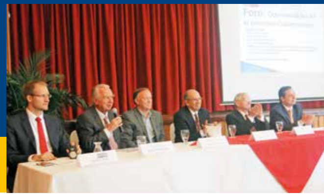
Panel members discussing family businesses.