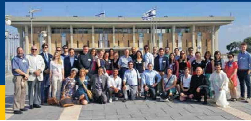
The participants of the dialogue seminar "Religion and Politics – Faith in Times of Upheaval" visiting the Knesset