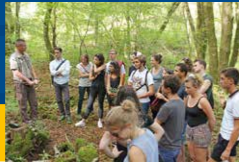
German and Hungarian participants of the seminar in Cadenabbia