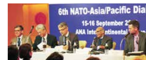
Intensive discussion of NATO-Asia relations during the 6 th NATO-Asia/Pacific Dialogue in Tokyo.

On 15 and 16 September 2016, the 6 th NATO-Asia/Pacific Dialogue took place in Tokyo. In the sixth year since its inception, the dialogue examined the subject of "Asian Security Dynamics and NATO Partnerships". The annual event is organised by the Regional Programme Political Dialogue Asia and the Pacific in cooperation with the Public Diplomacy Division of NATO. NATO member states depend on peaceful developments in Asia and the settlement of intra-regional differences there and they see their own security as closely linked to the situation in Asia. The dialogue facilitated intensive talks between NATO representatives, experts and government advisors from Germany, Australia, China, India, Japan, Mongolia, New Zealand, the Republic of Korea and Pakistan. The two-day "Track 1.5" conference offered a unique opportunity for an intensive exchange of views about NATO-Asia relations and common interests. All participants agreed on the need to build robust partnerships to overcome future security challenges.