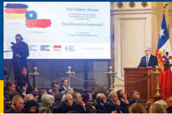
President Michelle Bachelet and Federal President Joachim Gauck opening the Chilean-German Congress on Democracy on 12 July