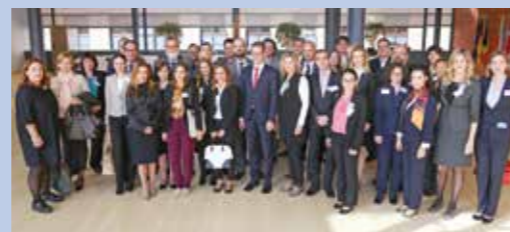
Government communication officials from over 15 European countries met at the SEECOM conference in Brussels.