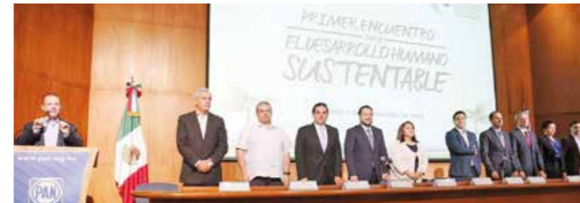
The reception panel comprised high-ranking decision-makers from the PAN, including Ricardo Anaya, party chairman, Senator Silvia Garza Galván, Damián Zepeda, Secretary General of the PAN, Marko Cortés Mendoza, chairman of the federal parliamentary group of the PAN, and Marcelo Torres Cofiño, chairman of the regional parliamentary groups.

In 2016, the Partido Acción Nacional (PAN), KAS' Christian-democratic partner party in Mexico, set up a coordination office for sustainable development in order to contribute to climate and environmental protection. On 7 September, its chair, Senator Silvia Garza Galván, assisted by the KAS Mexico office and the PAN's environment network, sent out invitations to a symposium on this topic. The event was attended by over 200 senior political figures from around the country. They discussed environmental and climate-related challenges affecting the country, determined key areas on which to focus party policy and compiled initial ideas for a joint party-specific action plan.