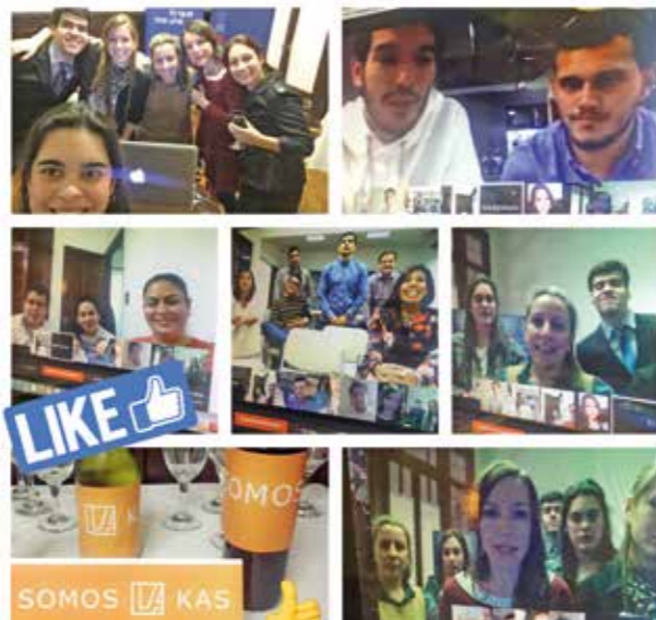
Launch of the #Somos LA KAS ("We are LA KAS") network via video conference and live stream.

and enables them to help each other, drawing on their own political experience. The enthusiastic comments and greetings posted via WhatsApp groups that evening in parallel with the event bode well for this initiative.