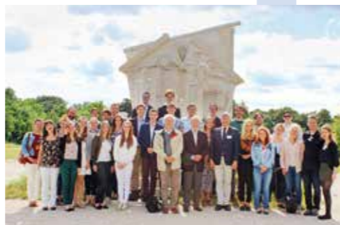
The participants of the KAS summer school in front of the Konrad Adenauer memorial in the heart of Budapest

One highlight was the opportunity to exchange ideas with Gergely Gulyás, Vice President of the Hungarian National Assembly, in the Hungarian parliament. The agenda also included a one-day excursion to Sopron, location of the Pan-European Picnic of 1989. During a workshop on the European Community of Values, the participants devised the "Budapest Declaration on European Identity". They had also gained a good insight into Hungarian politics and expressed their intention to stay in touch via social media.