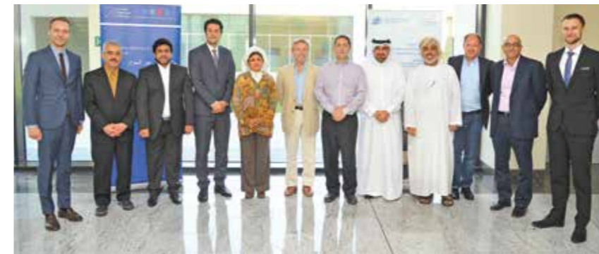
Experts on parliamentary representation assembled to discuss people's representations in the Gulf

The Gulf countries do not conjure up an image of political diversity with respect to the way they are governed. However, closer inspection reveals some variety in the legislative remit of people's representations, ranging from an advisory role to genuine legislative power, making remarkable case studies for research.