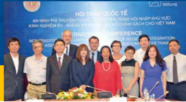
Experts from Vietnam, Germany, Spain and Malaysia consulted about ways of strengthening NTS.