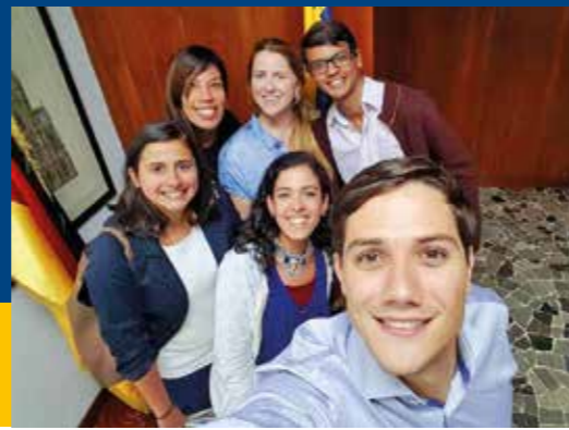
The group of participants from Caracas, Venezuela after the video conference on the peace process in Colombia.