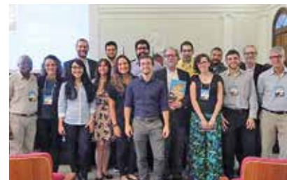
The GESEL team (Electricity Sector Study Group from the Universidade Federal do Rio de Janeiro (UFRJ)), a KAS partner