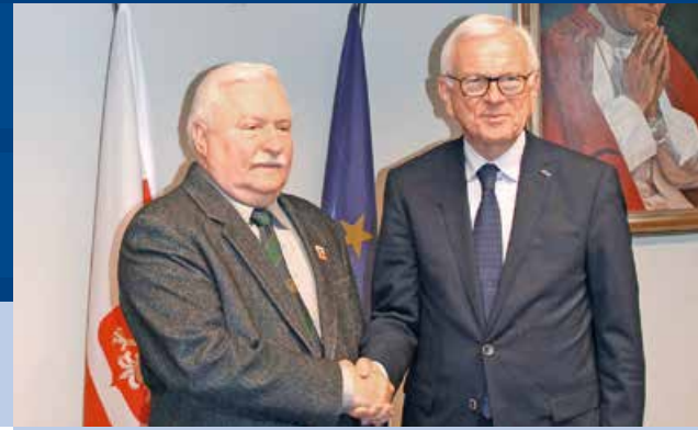
Lech Wałęsa, President of Poland (ret.), and Dr Hans-Gert Pöttering