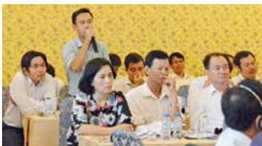
The debate on e-governance also sought the views of the audience.

representatives of the 12th district and the attending experts discussed the strengths and weaknesses of the current system and drew up models for the future that mirror reality. Key topics included the legal principles of e-governance, transparency, involvement of the population and the protection of privacy.