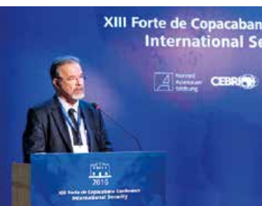
Raul Jungmann, Defence Minister of Brazil

and Brazil in this were talked about in detail. Internationally, the conference is regarded as one of the most important discussion forums on Latin American security policy. Global events of recent months have reinforced the need for dialogue between Latin America and Europe on these issues even more.