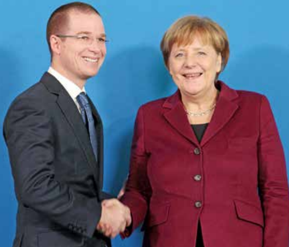
Federal Chancellor Dr Angela Merkel greeting PAN President Ricardo Anaya in the Konrad-Adenauer-Haus