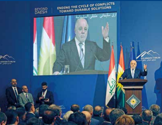
The Iraqi Prime Minister Haider al-Abadi opening the Sulaymaniyah Forum