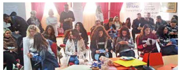
The workshop discussions included the issue of achieving consensus in everyday party politics.

The strengthening of pluralism and participation plays an important role in the context of social transformation processes. Against this backdrop, the KAS office in Albania, together with the Friedrich-Ebert-Stiftung, organised a training session for young stakeholders in local politics in Korçë and Shkodër. The event was designed to raise young people's awareness of how interests are actively represented at the local level. The training session was carried out in collaboration with CIVIC GmbH from Germany in the form of a role play. Using this type of training format, the tasks and challenges of local policy were communicated effectively and potential courses of action were drawn up.