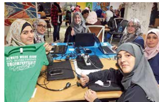
Participants of the hackathon organised by the KAS office in Ramallah and Gaza Sky Geeks

On 1 December 2016, the local start-up sponsor Gaza Sky Geeks joined forces with the Konrad-Adenauer-Stiftung to stage a three-day hackathon in the Gaza Strip. At these meetings, designers, coders and young entrepreneurs develop and test IT solutions and talk about their work. Under the somewhat provocative title "Lady Problems", young entrepreneurs came together to specifically promote their participation in economic life. While the average percentage of females at hackathons is around 20 per cent, the event organised by the KAS and Gaza Sky Geeks was attended almost exclusively by women.