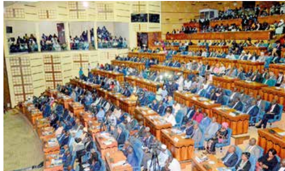
With more than 1,000 delegates in attendance, the annual general meeting of the KAS partner CNP broke a new record this year in terms of participant numbers.

public-private partnership and set up a discussion group on the economic policy potential of the oil and gas discoveries off the coast of Senegal. In 2016, Senegal's economy grew by almost seven per cent, representing the highest growth rate for the last twelve years.