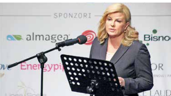
Kolinda Grabar-Kitarović, President of the Republic of Croatia