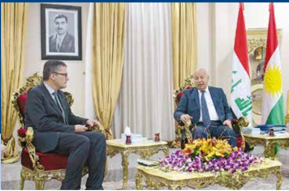
MP Kiesewetter speaking to Minister Sinjari on future political challenges in the KRI and in Iraq following the liberation of Mosul