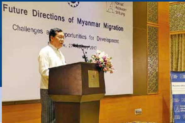
U Thein Swe, Myanmar's Minister of Labour, Immigration and Population, presented the principles of the government's policy on migration.