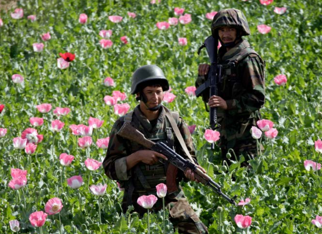
Poppy fields: Drug cultivation in Afghanistan was used by both al-Qaeda and the Taliban as a source of income.

long-standing growth of drugs in Afghanistan and in the Andes has contributed to a reliance on crop production and drugs when it comes to terrorist financing in these two diverse regions. 21