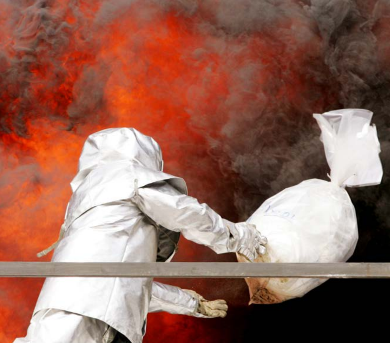
Burning drugs: Drug trafficking provides by far the largest funding for terrorism worldwide.

contrast, IS – with its greater financial responsibilities on its territory in addition to its global ambitions – needs to generate more money from criminal activity and illicit trade than any preceding terrorist group. Fortunately, for IS, it controls a region rich in energy resources and has sophisticated personnel capable of arranging the smuggling of the large quantities of oil that it generates. Yet it also has a diversified funding model generating resources from many diverse activities including but not limited to: extortion, kidnapping, human smuggling and trafficking, smuggling of antiquities, smuggling