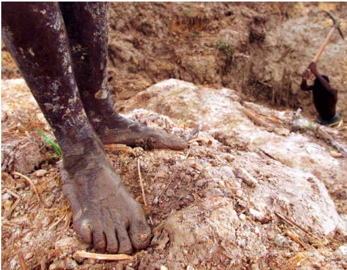
Mineworkers in Sierra Leone: Terrorist organisations are keen to make use of whatever resources they may find.

All terrorist groups do not function the same way in business. Cultural, historical and geographic conditions shape their approach to terrorist financing. For example, in the Middle East where trade has been at the heart of the economy since the first recorded language, trade or taxing trade is the major funding source of IS and other groups such as the PKK operating in the region. Trade-based money laundering is an important means to move money. 20 The