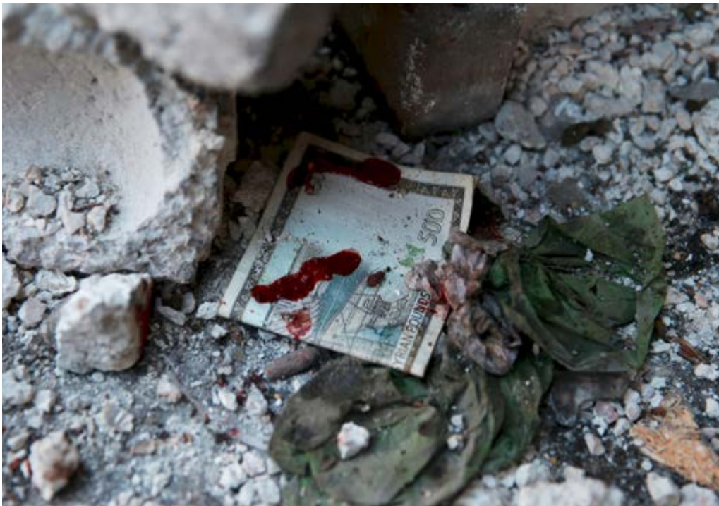
Syrian currency: The prevailing chaos of the civil war is exploited by IS in order to move around large sums of money.

Although the FARC, at its height, controlled significant territory in Colombia, it did not control as many people nor did it seek to set itself up as a model system of governance. Neither did it seek to inspire terrorism outside its region. In