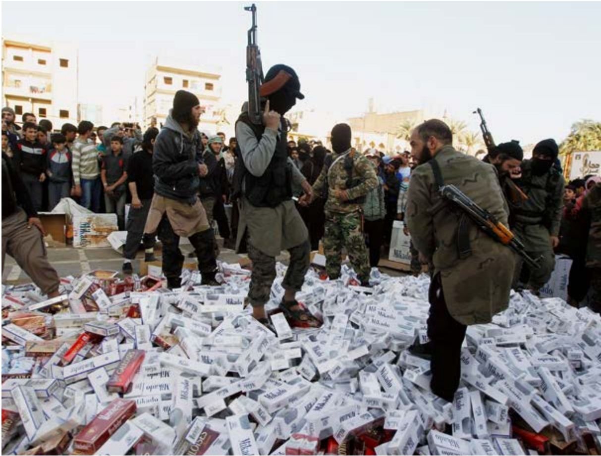
Confiscated cigarettes: IS derives its funding from the illegal tobacco trade, but it does not penalise authorised smuggling.

“non-traceable communications, forgers, and money launderers”. 37 Without hiring this expertise, they cannot make their business function. 38