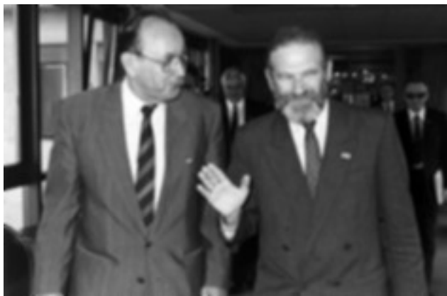
The German-Polish rapprochement would have been more difficult to achieve without the diplomatic skills of Foreign Ministers Bronisław Geremek (r.) and Hans-Dietrich Genscher.

of unemployment, industrial wastelands and emigration to western German regions provided for incredulity. Citizens of the former GDR who experienced communism will certainly disagree, but, from a Polish perspective, the GDR was paradise. There was also the question of how Poland would have looked if as much money had been invested there as the Federal Republic of Germany issued for development between Rügen and the Ore Mountains.