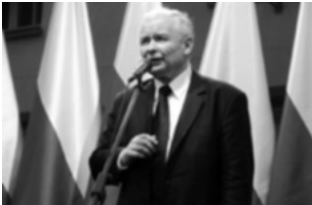
Jarosław Kaczyński, chairman of the national-conservative PiS and former Polish Prime Minister, is known to criticise Germany primarily to score domestic points.

Transatlantic relations provided the backdrop for further differences. The new government led by the Law and Justice Party in 2005 with President Lech Kaczyński soon afterwards brought about media-led taunts. This was triggered by a satirical piece in the newspaper taz in June 2006: "Jarosław [Kaczyński] lives with his own mother, but at least it's without a marriage certificate." 23 The line "Poland's new potato", published in the "Villains who want to rule the world" series, reinforced the notion that Germans are not exactly well known for their humour. This post appeared again in the press kit President Kaczyński had received in preparation for the Weimar Triangle anniversary summit. After reading this, he cancelled his visit to Germany, officially citing health reasons. The former foreign minister compared the taz with the Nazi newspaper Der Stürmer and the Polish public prosecutor's office opened an investigation against the German author for insulting a head of state. When he became Prime Minister in July 2006, Jarosław Kaczyński set about depriving the German minority of their privileges. The manoeuvres of the German Navy in the Baltic Sea, which caused a Polish ferry to have to change its course, were inflated to the point of scandal. 24