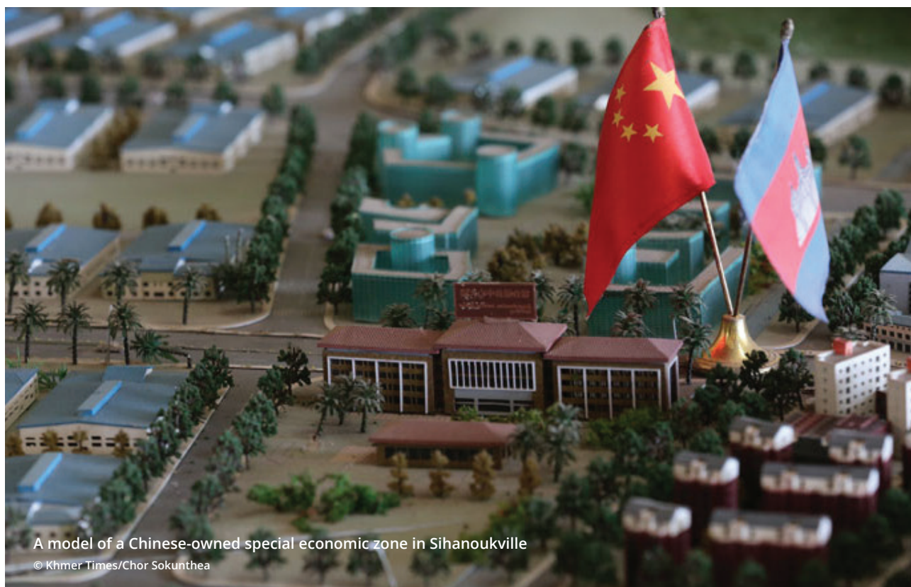
A model of a Chinese-owned special economic zone in Sihanoukville

way Project has been constructed by the state-owned China Communications Construction Company. In the energy sector, more than 7.5 billion USD in hydropower plants and about 4 billion USD in coal power plants have been invested as well as some 30 agricultural and agro-industrial projects (of which 21 are in operation).