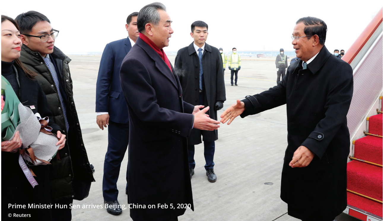
Prime Minister Hun Sen arrives Beijing, China on Feb 5, 2020

Cambodia has fully and actively engaged in China's BRI for the fact that economic development opportunities generated from this initiative are believed to be tremendous. Tangibly, by the end of 2017, more than 2,000 km of roads, seven large bridges, and a new container terminal at Phnom Penh Autonomous Port were constructed with the support from China. A new international airport in Siem Reap, Dara Sakor International Airport in Koh Kong province, and an international airport in Kandal province amounts to nearly 3 billion USD in approved airport projects. More interestingly, the 2 billion USD Phnom Penh-Sihanoukville Express-