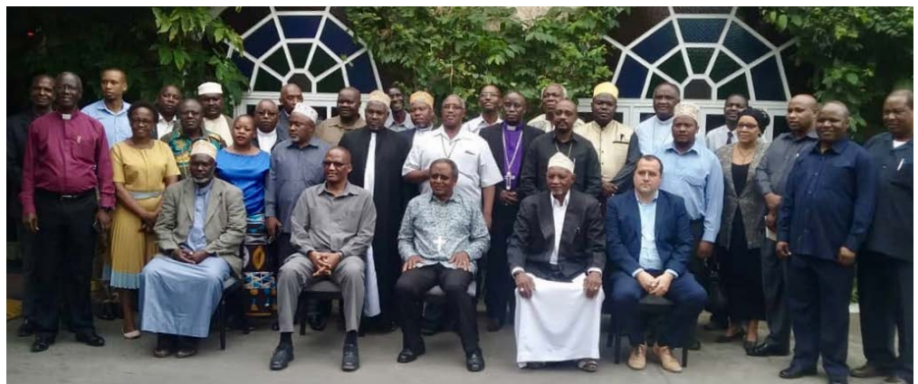
Participants of the round table discussion

ROUNDTABLE DISCUSSION AND BOOK LAUNCH DAR ES SALAAM