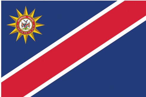
Flag of the Namibian Police Force until 31 October 2009

The Flag of the Namibian Police Force always takes secondary position when flown or hoisted together with the National Flag. The National Flag must be flown about 1,80 metres higher than other flags.