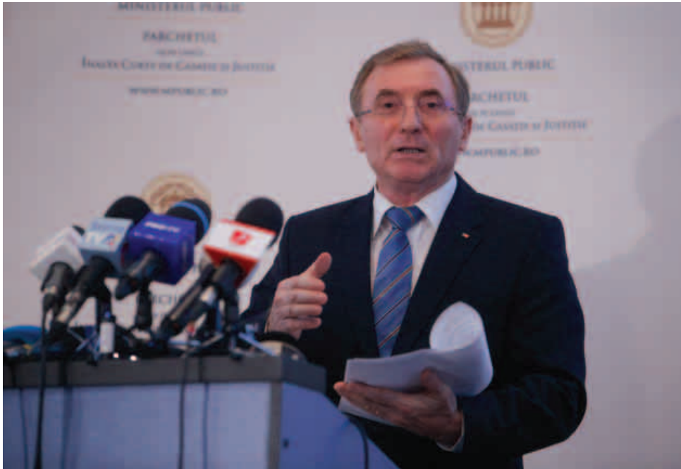
Press conference held by the General Prosecutor Augustin Lazăr at the General Prosecutor's Office, Monday, August 27, 2018.