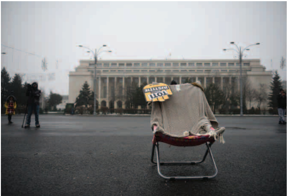
Dozens of people participating in a silent protest, in front of Victoria Palace, against the changes brought to the justice laws, the Penal Code and the Criminal Procedure Code, Sunday, January 21, 2018. The protest is part of a wide international movement known as "Stolen Justice".