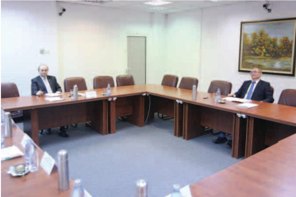
Tudorel Toader and Augustin Lazăr participating in the Superior Council of Magistracy's session, Monday, November 19, 2018.