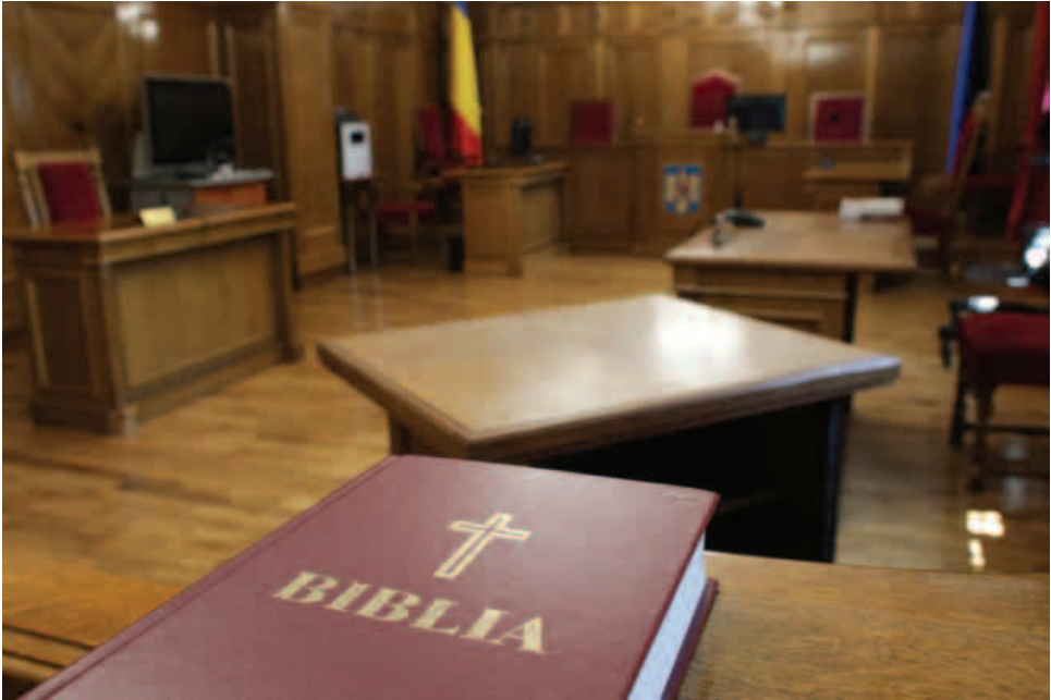
Courtroom inside the High Court of Cassation and Justice in Bucharest.