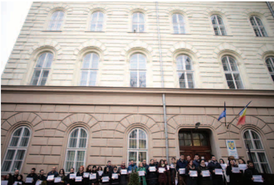
Timișoara magistrates' protest against the changes brought to the justice laws by GEO no. 7, in front of Timișoara Dicasterial Palace, Friday, February 22, 2019.