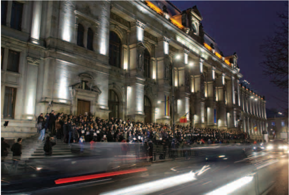
Bucharest Court of Appeal's magistrates protesting against the changes brought to the justice laws and the Penal Code, Monday, December 18, 2017.