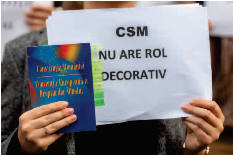
Magistrates' representatives from all over the country protesting in front of the Court of Appeal, against the way Justice is managed, Bucharest, Sunday, September 16, 2018.