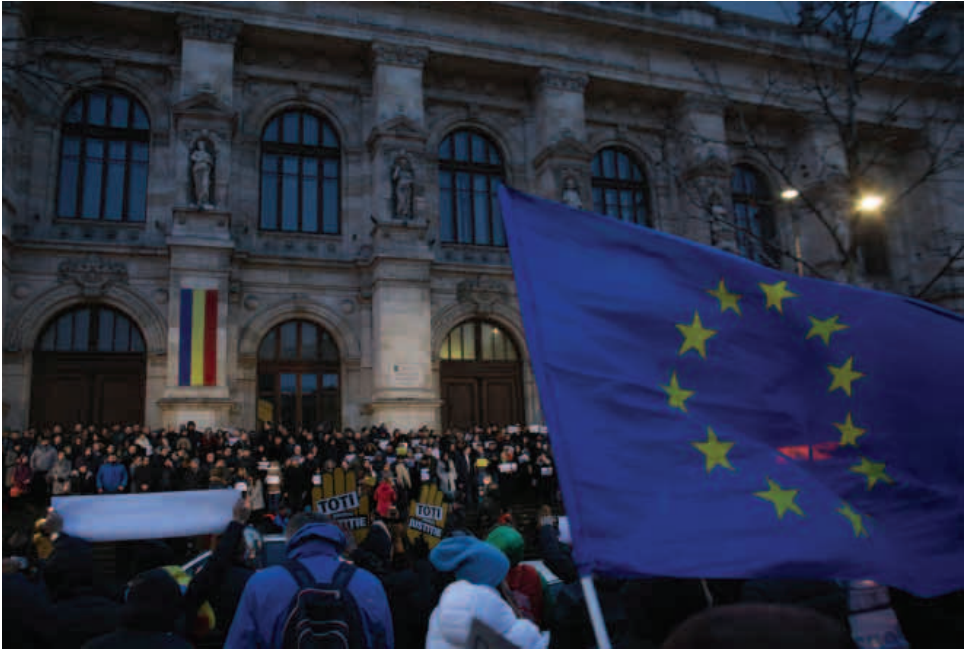
Bucharest magistrates' protest against the changes brought to the justice laws by GEO no. 7, on the steps of Bucharest Court of Appeal, Friday, February 22, 2019.