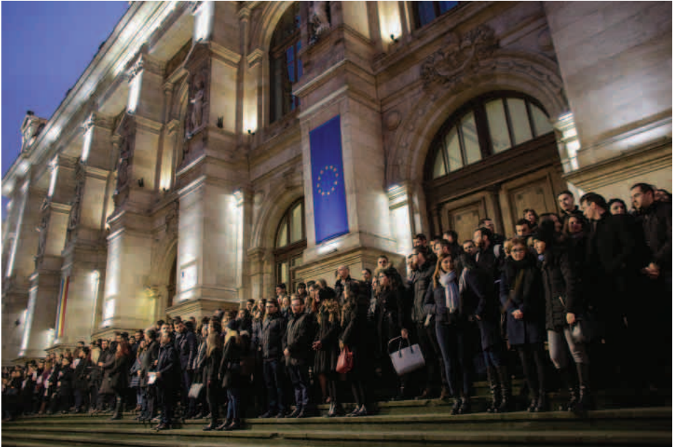
Bucharest Court of Appeal's magistrates protesting against the changes brought to the justice laws and the Penal Code, Monday, December 18, 2017.