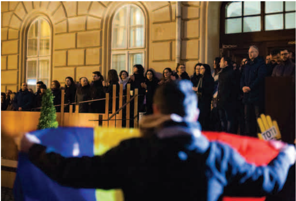
Approximately 50 magistrates protesting at the main entrance of Timișoara Local Court and the Prosecutor's Office attached to Timișoara Local Court, against the changes parliamentarians wanted to bring to the justice laws, Timișoara, Timiș, Monday, December 18, 2017.