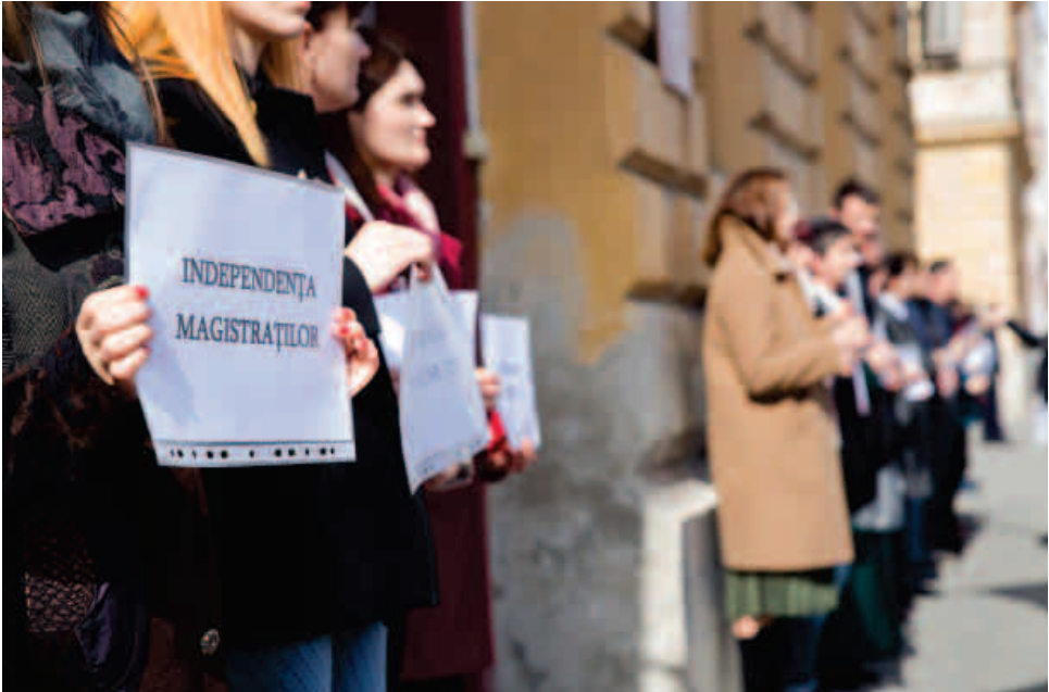
Sibiu magistrates protesting against the recent changes brought to the justice laws, Friday, March 8, 2019.