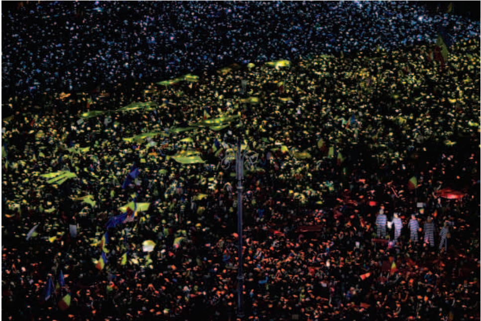
People protesting, for the 13 th consecutive day, against Grindeanu's Cabinet and PSD leadership, forming an immense version of the Romanian flag in Victoria Square, February 12, 2017.