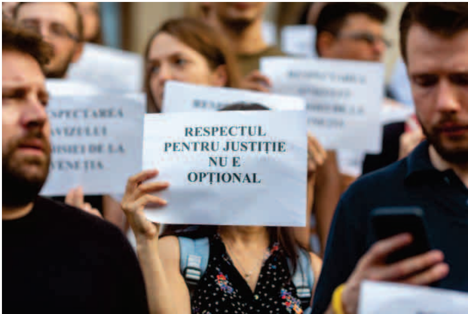
Magistrates' representatives from all over the country protesting in front of the Court of Appeal, against the way Justice is managed, Bucharest, Sunday, September 16, 2018.