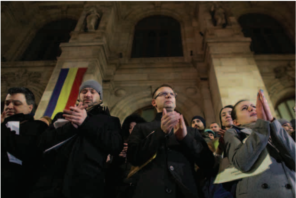
Bucharest magistrates' protest against the changes brought to the justice laws by GEO no. 7, on the steps of Bucharest Court of Appeal, Friday, February 22, 2019.