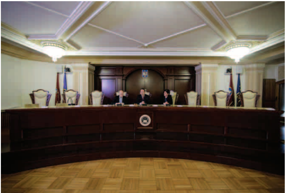
The visit of the President of the European Union's Court of Justice, Koen Lenaerst, at the Romanian Constitutional Court's office, in Bucharest, Monday, November 6, 2017.