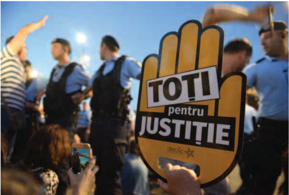
Violent incidents during the protest against the Romanian Constitutional Court's Decision, according to which Laura Codruța Kovesi must be removed from the position of Chief Prosecutor of the NAD, Wednesday, May 30, 2018.